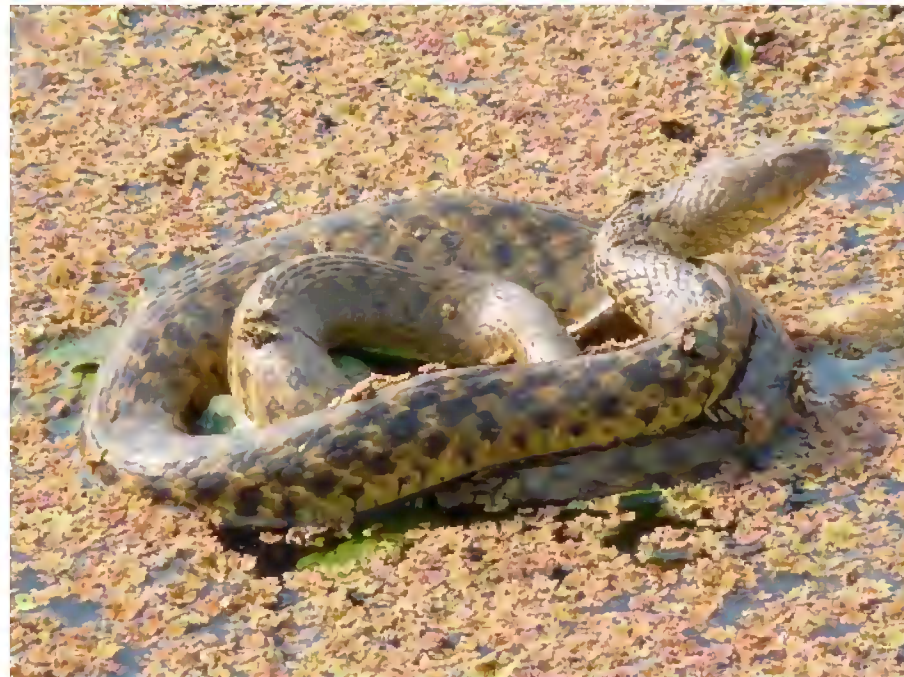
Fig. 2N. Checkered Keelback Xenochrophis piscator .